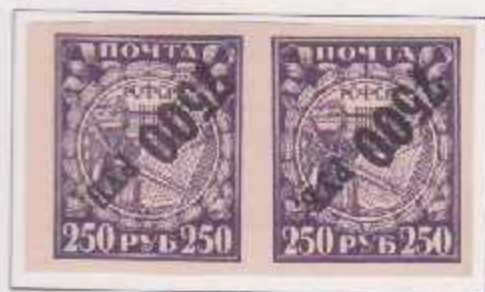
Var. Surcharge inverted.