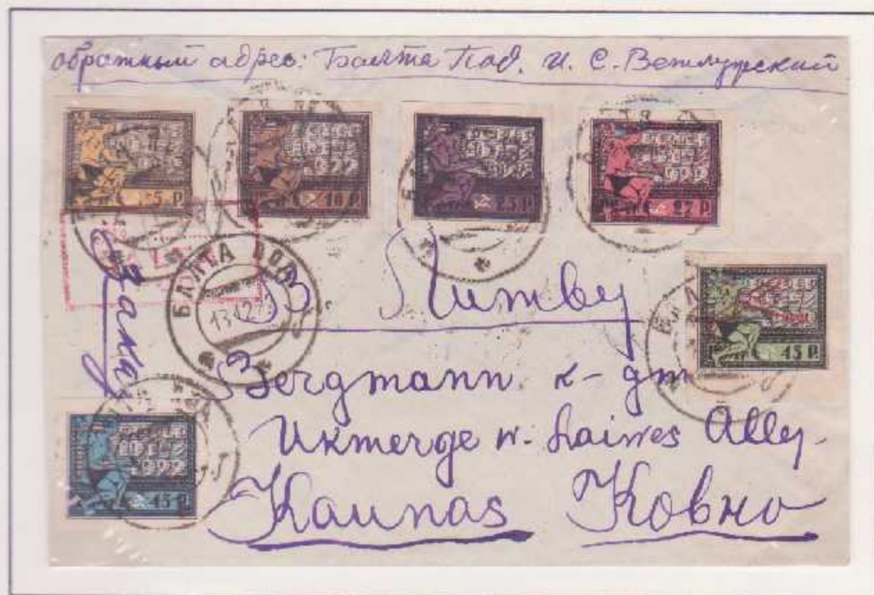
13.12.22. Batta (Ukraine) to Kaunas, Lithuania. Registered