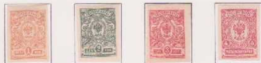
No Varnish Lines