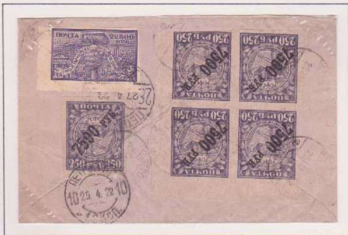
25 4 22 Petrograd to Paris, Registered

Correct postage (60,000 R) for registered foreign letter 1. 4. 22 - 30. 4. 22.