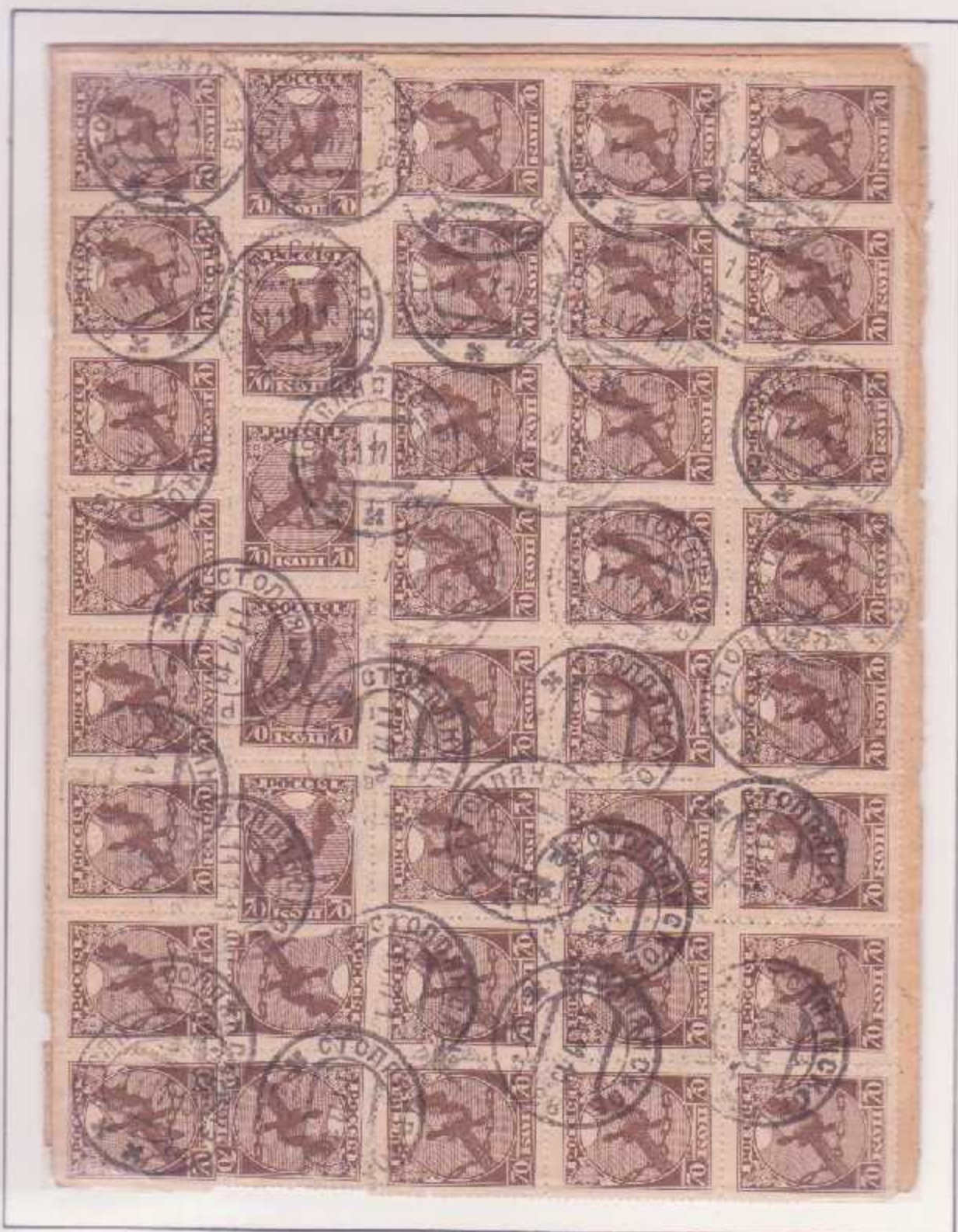
11. 11. 19 Unvalued parcel card Stolpinskoye to Moscow for 40lb parcel. 50R charge paid with 85x70k "Sword and Chain" and 4 Arms stamps.