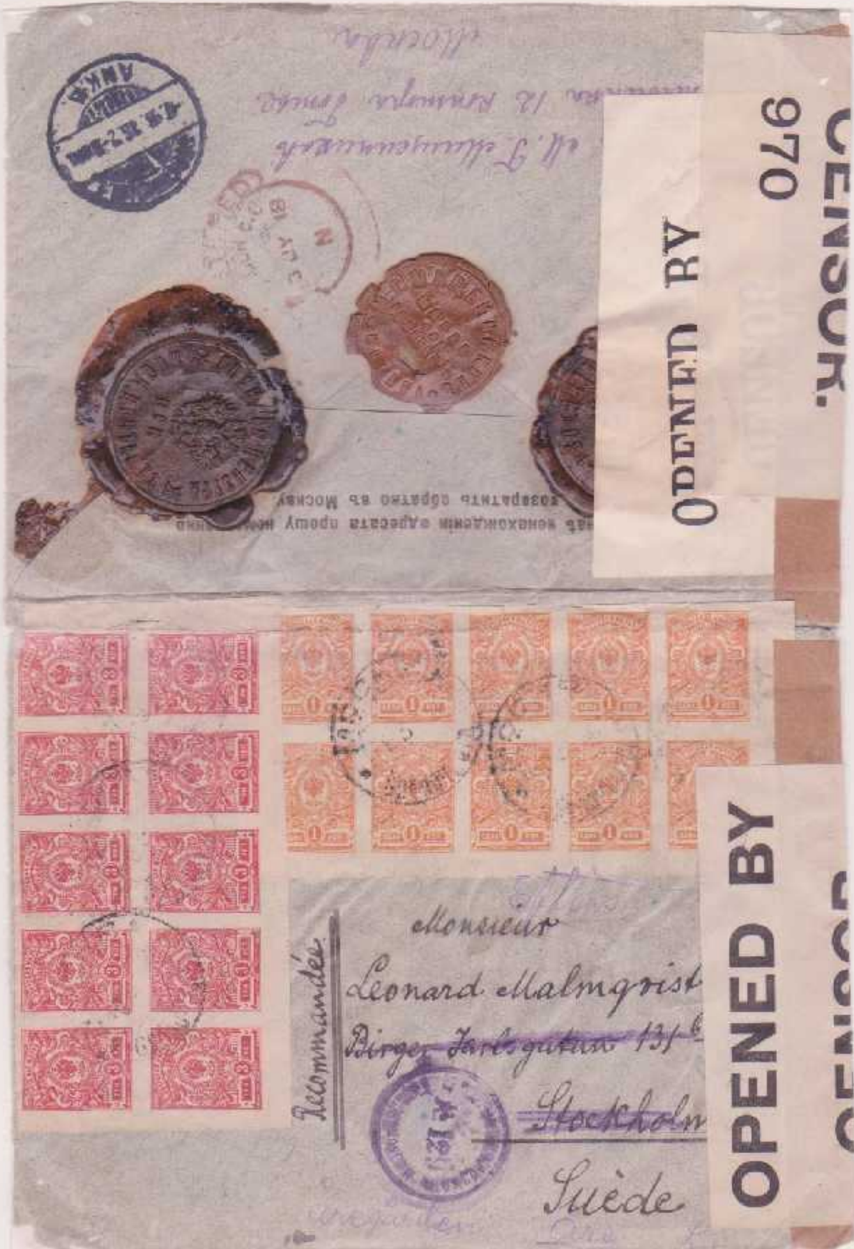
8. 3. 18. Moscow to Sweden, 10x7k+10x3k Imperf. Arms. Latest recorded Moscow censorship wax seals.