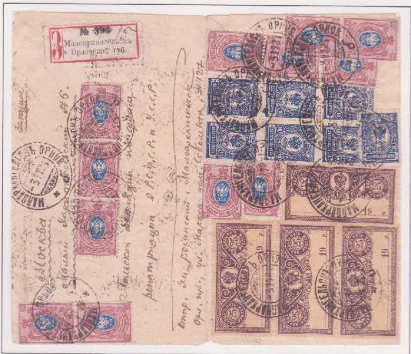
3. 11. 21. Registered Malangeisk to Polish Repatriation Delegation, Moscow. 1,250 Roubles.