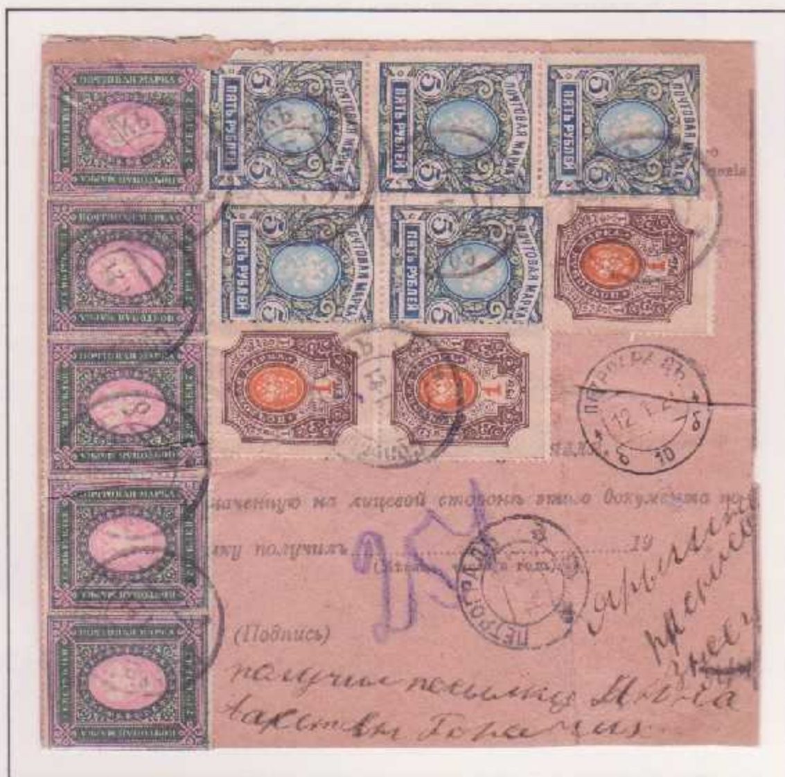
3.1.21 Unvalued parcel card Stoychegodsk to Petrograd with 3x1R and 10 (front and back) x 7R Arms of 1919.