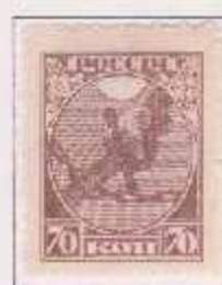
Var. Rough Perfs.