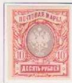
Thick Varnish Lines