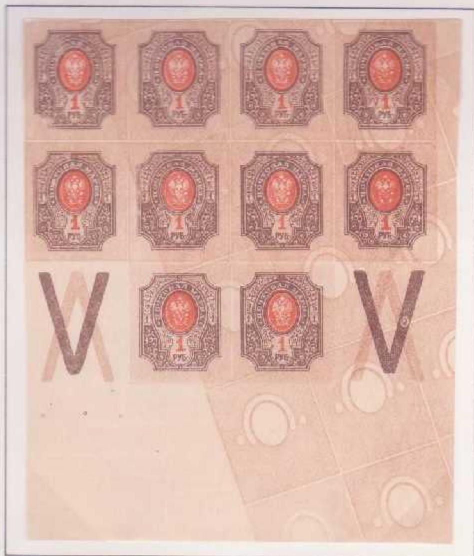
1R Lower part sheet with additional printing of background.