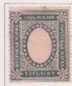
Var. Arms omitted