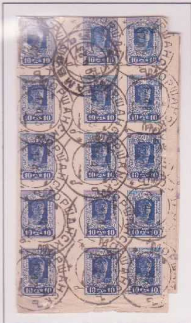
17.4.23 Morshansk local letter with 15x10R. 150R(22) = 1.5R(23). Correct.