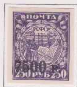
Horizontal overprint prepared for use but not issued.