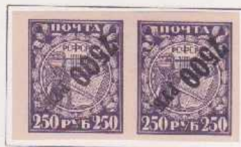
Var. Surcharge inverted.