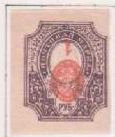
Var. Inverted centre