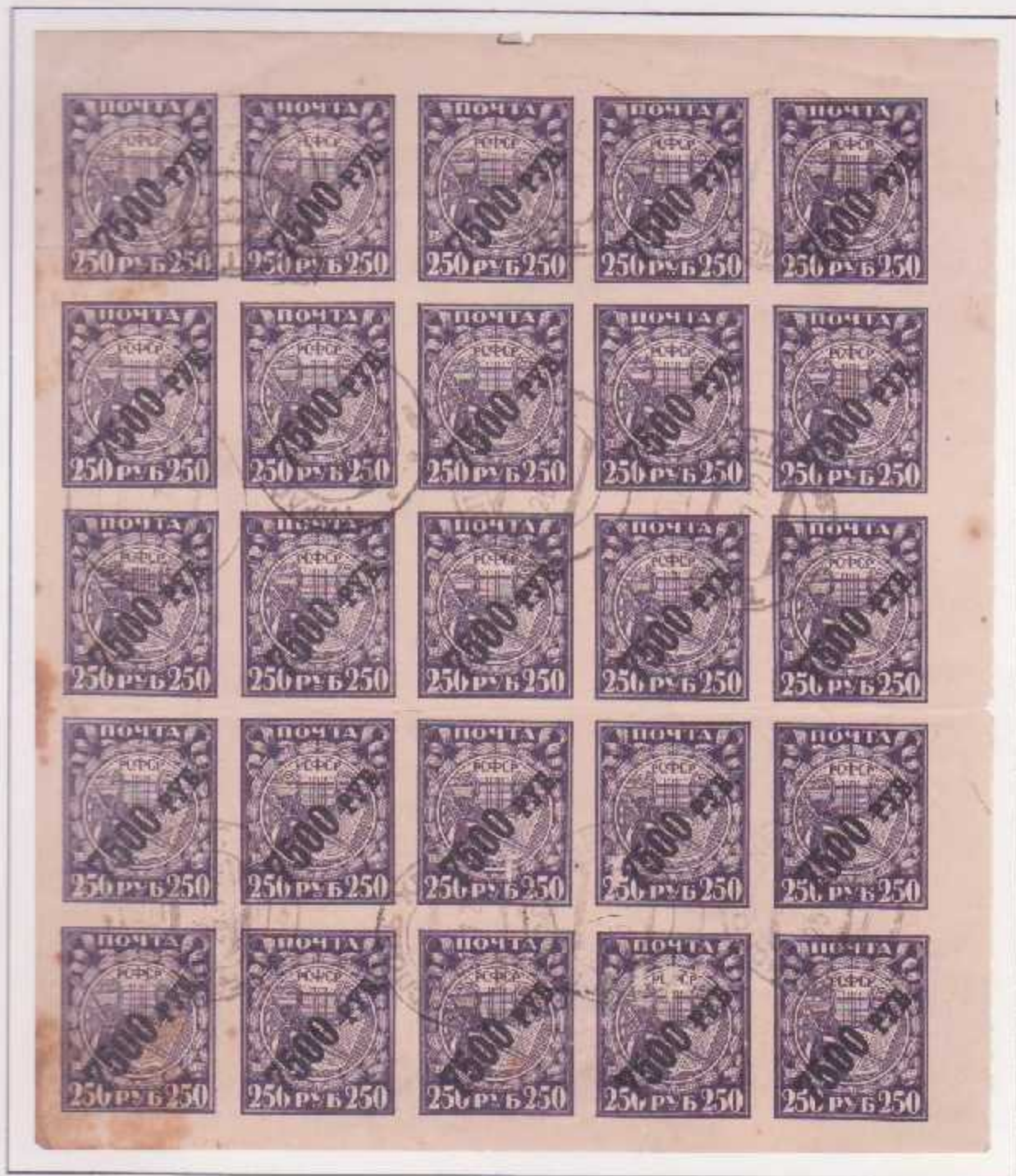
Pane of 25 7500 R overprint on 250 R 'Science and Art' used 25.7.22. A Registered foreign letter would have required 120 of these for correct postage.