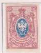
Thick Varnish Lines