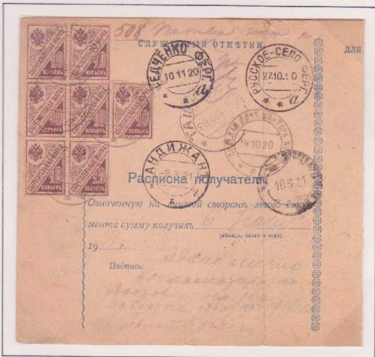
September 1920 - March 1921 exceptional Money Order from Uhiik via Tashkent, Andizhan, Fedchenko, Russkoe Selo and two Field Post Offices to some person who was difficult to locate.

Franked with 14x10k (7 front, 7 back) Postal Savings Bank stamps.