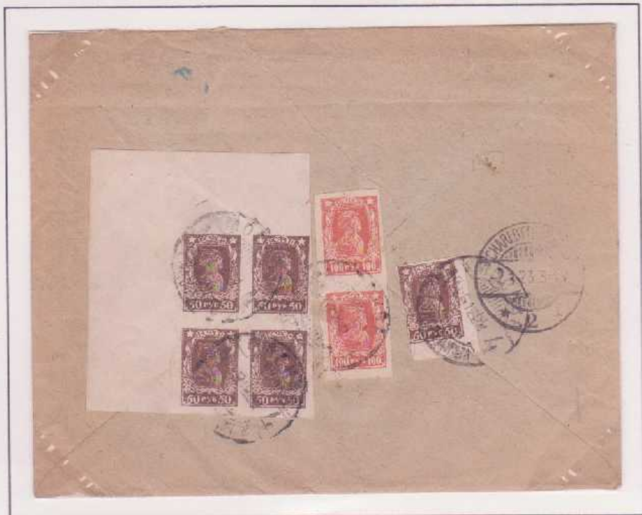
29.12.22. Registered Airmail Moscow to Berlin. 450R postage.