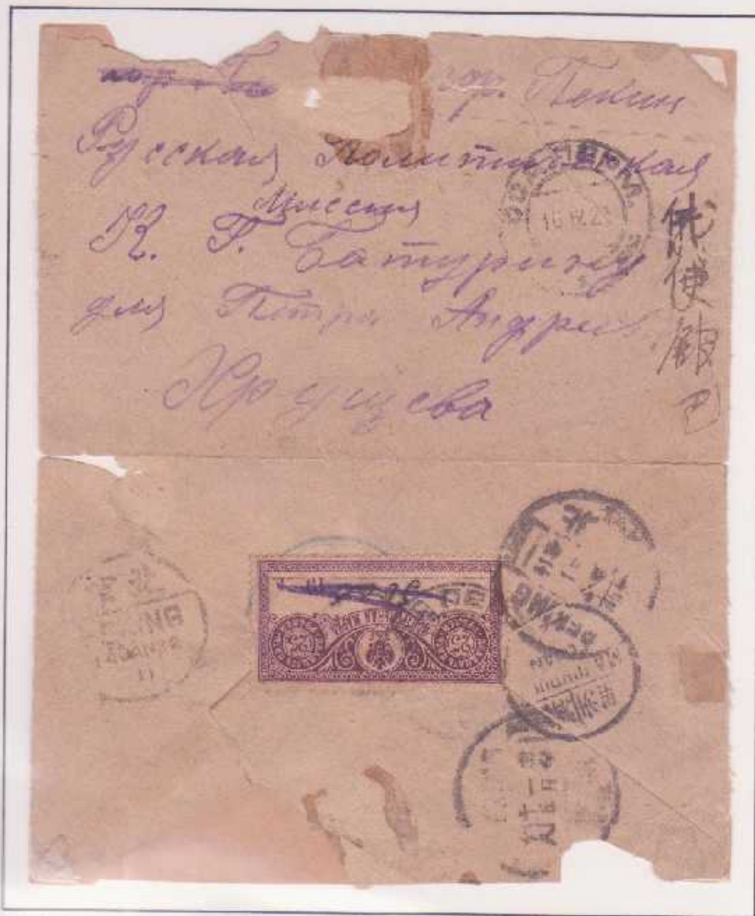
16 12 21 Osalerm to Peking, China via Manchuria.

This home-made poor quality envelope with a 25R Control stamp for postage has great philatelic significance. It is the only example so far recorded, where, the correct postage rate (5,000) has been applied in manuscript to the stamp.