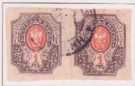
Var. Thick "1"