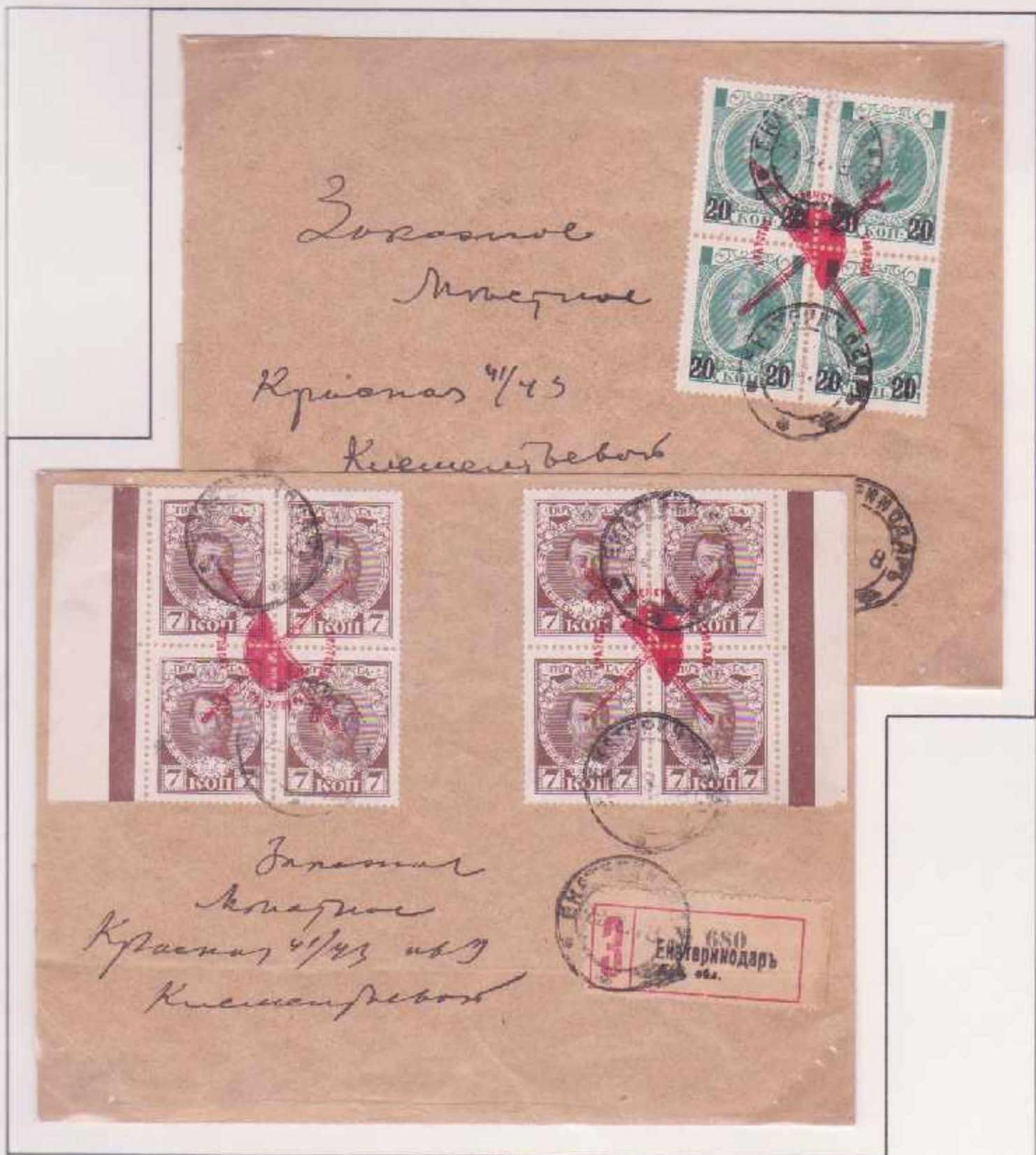
Two philatelicly inspired Registered envelopes from Ekaterinodar, 6.2.18: 22.2.18, with "Revolutionary" overprints on Romanov issues.