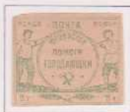
Proof on rough paper.

Famine Relief stamps issued at Rostov-on-Don, lithography, imperf without gum, they were designed by A. Manevcha and depict allegorical famine related designs. The stamps had no franking value but were for use in addition to normal rates on postal articles.