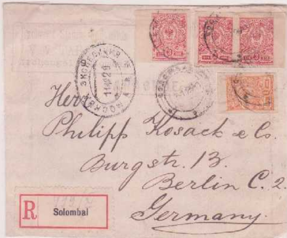
3.12.20. Solombal to Berlin. 3 \times 3k + 1k = 10k . Revalued \times 100 = 10R . Sent at Inland rates.

Because of inflation and depreciation of currency, the Arms values 1-20 kopeks were authorised for sale at 100 times face .