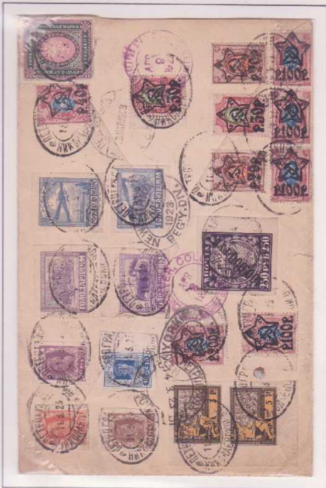
Full set of famine relief issue on reverse of registered letter from St Nikolai Station, Petrograd 11.3.23 to Denver USA. 29 stamps used.