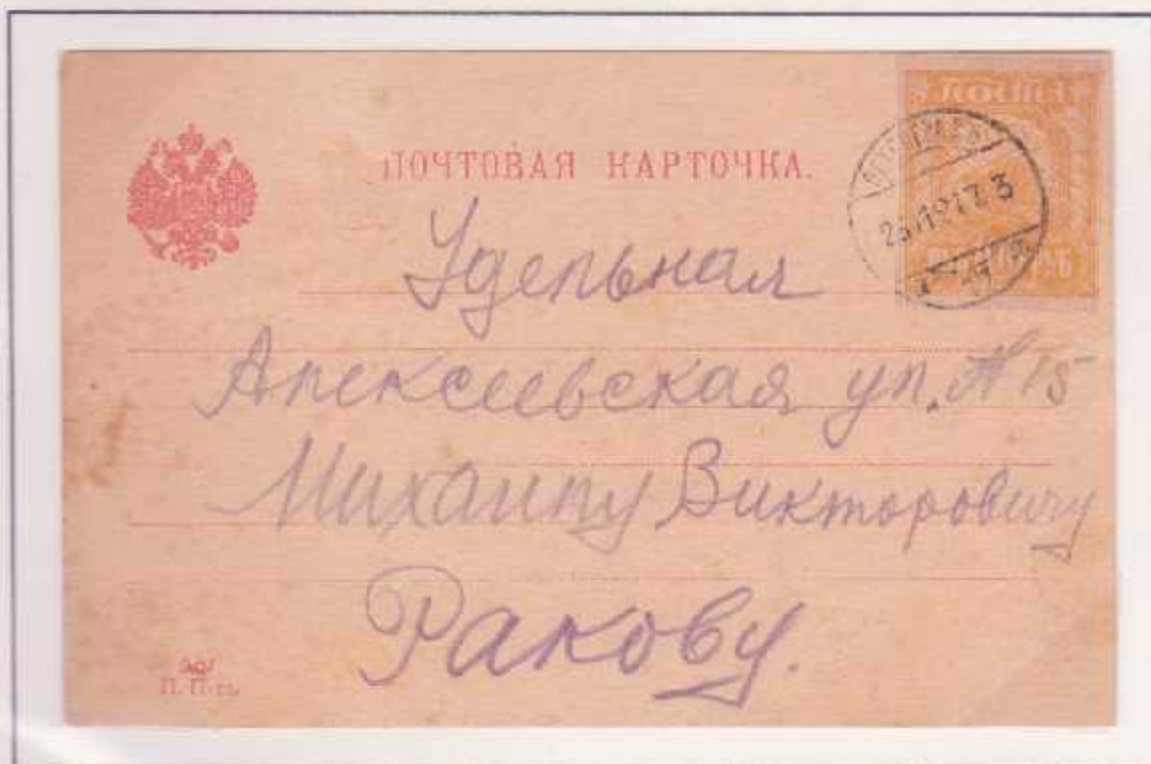
26. 11. 21 Petrograd local postcard, 100R correct postage.