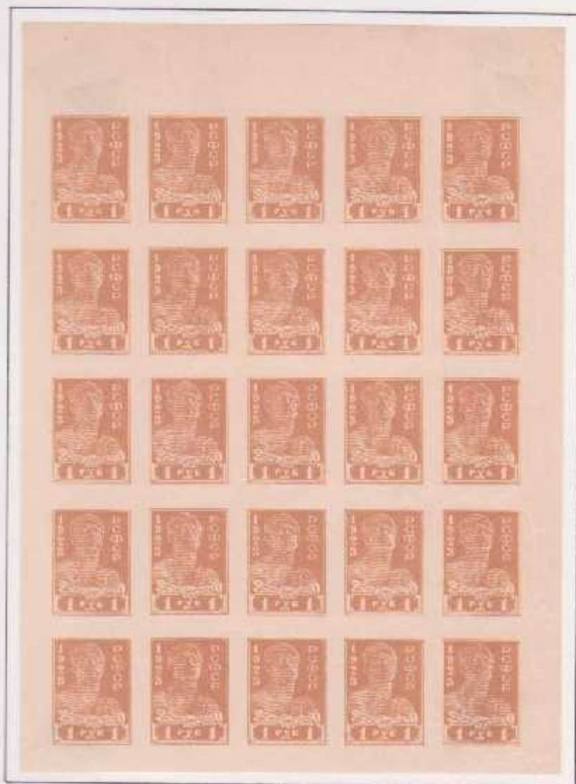
1R Worker stamp was prepared but not issued.

In the original set of the 1923 Definitives, both 1R and 2R values were planned with a small number of sheets being prepared. Continued hyper-inflation and rising postal rates meant that these values were not issued.