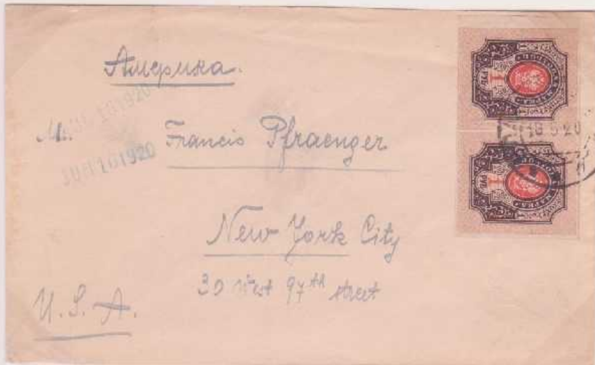
18.5.20. Vladivostok (Far-Eastern Republic) to New York. 2R postage at face value.