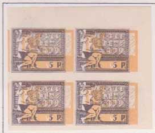
4.5mm orange-yellow shift