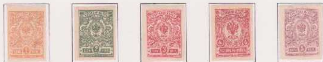
Thick Varnish Lines