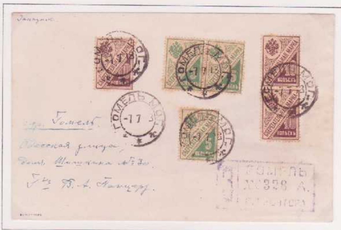
7.7.18. Gomel. Registered Local letter.