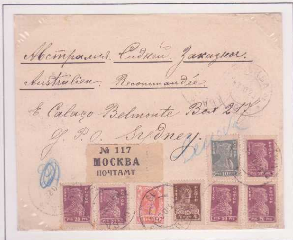
13.10.23 Moscow to Sydney, Australia, registered, via Italy with philatelic tax stamp on back. Postage 115R including 20R imperf at base.