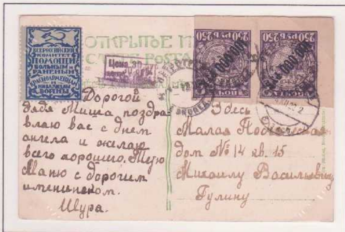
Petrograd 4.12.22 Correct postage, 200,000R = 20R (1922), 1.12.22 - 1.1.23