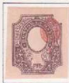
Var. Displaced centre