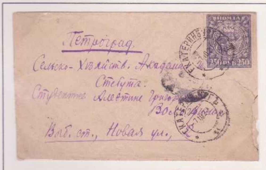
7. 10. 21 Ekaterinburg to Petrograd, 250R correct postage.

Surviving internal letters and cards are scarce both during and after the Civil War and the consequent economic collapse, famine and disease.