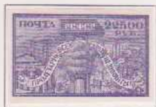
Proof on white paper