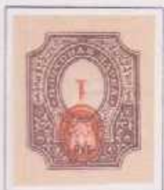
Var. Inverted Centre & Displaced Background