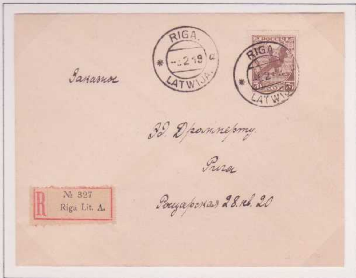
70k used Riga - 1st Latvian Soviet Republic (Jan-May 1919) - Free post period - 5.2.19