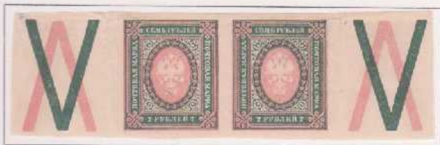
Lower part of sheet