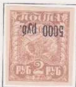
Var. Overprint inverted