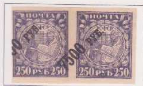
Var. Surcharge misplaced