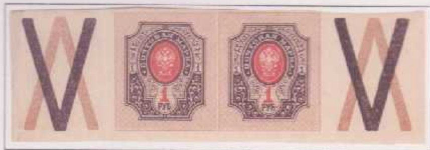
Lower part of sheet