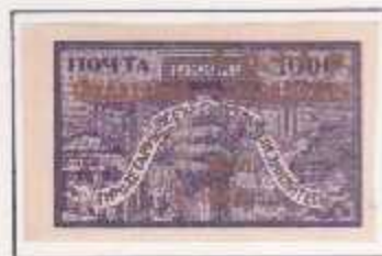
Var. Date spaced '1 923'