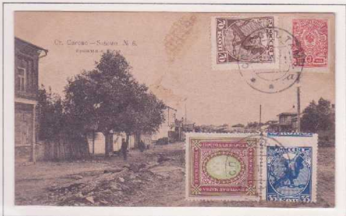
35k with displaced perfs and 70k on postcard Spassky to New York 12.1.21