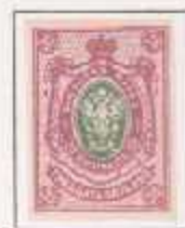
No Varnish Lines