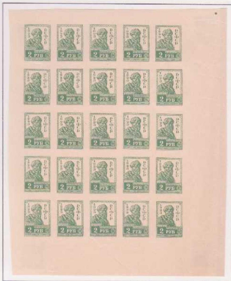
2R Peasant stamp was prepared but not issued.

The 1923 Definitives were used concurrently with stamps of 1922 currency until November 1, 1923, when they were withdrawn.