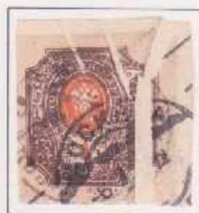
Var. Pre-printing creases