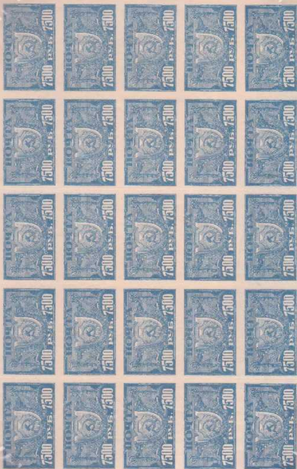
Complete sheet (25) on watermarked paper.