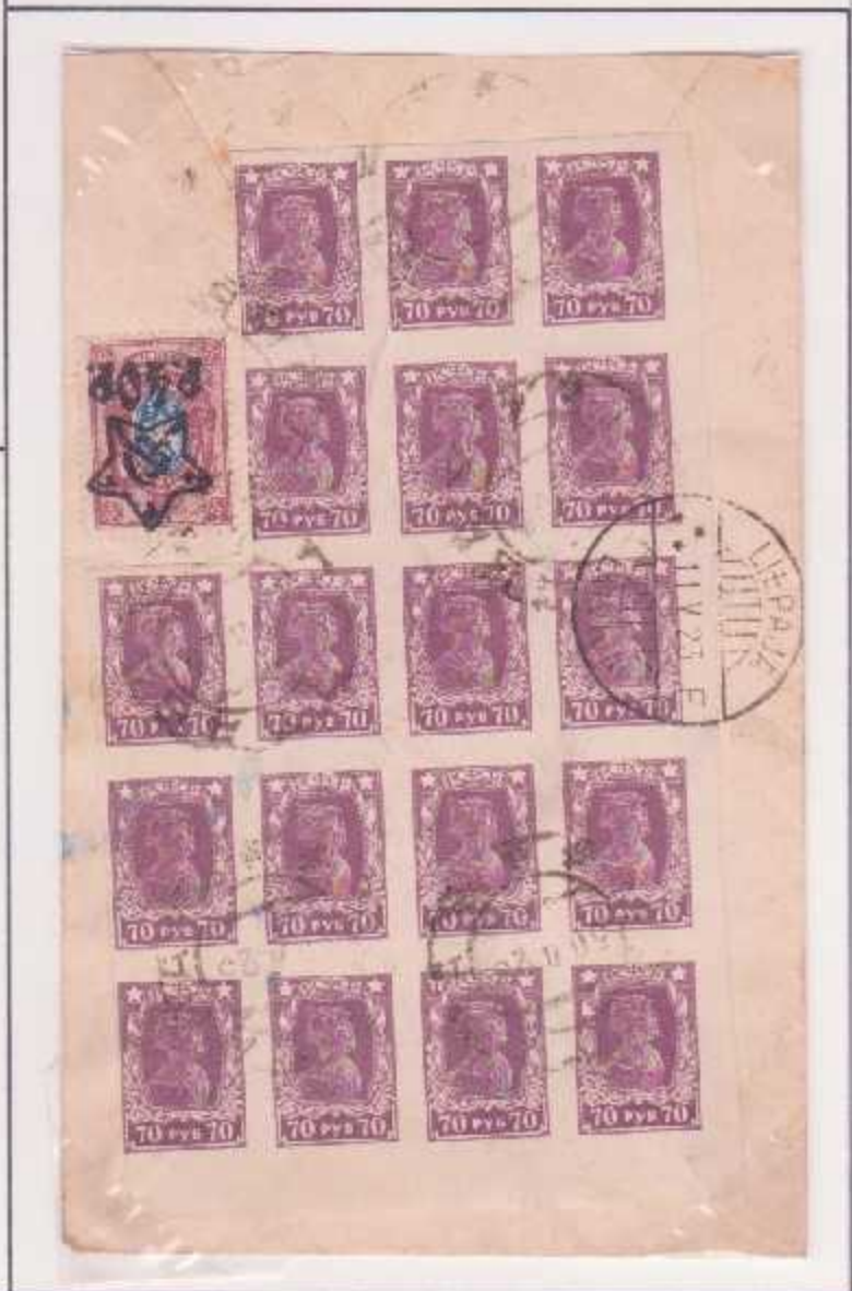
30.4.23 Pslava to Latvia, registered with correct postage, 13R (1300R(22)) for the period 6.4.23 to 8.5.23.